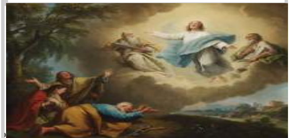
Landschaft mit Verklärung Christofrancesco Zuccarelli (1702-1788)

You are never alone! For a shared a prayer, or just have someone listen to you, a candle lit for you or yours, have a mass offered for your intention or that of a loved one living or dead, please speak to the priest. Thanks.