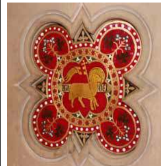
Ornamental altar detail.