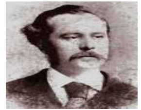
Edward Welby Pugin

Contact: St. Stephen's Hospitality Team St. Stephen's Parish 8 Bank Street, Blairgowrie, PH10 6DE. Phone: 01250872171