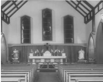
St. Stephen's, 1968.