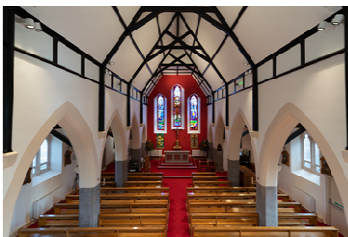
The Gothic detailed renewed Interi-