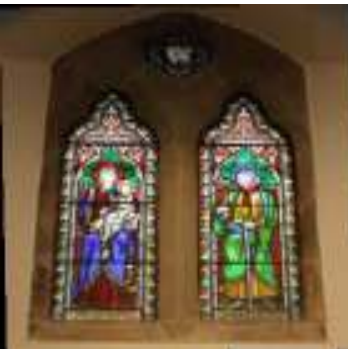
Detailed stained glass windows