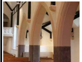
Columns and arches in the Gothic style.